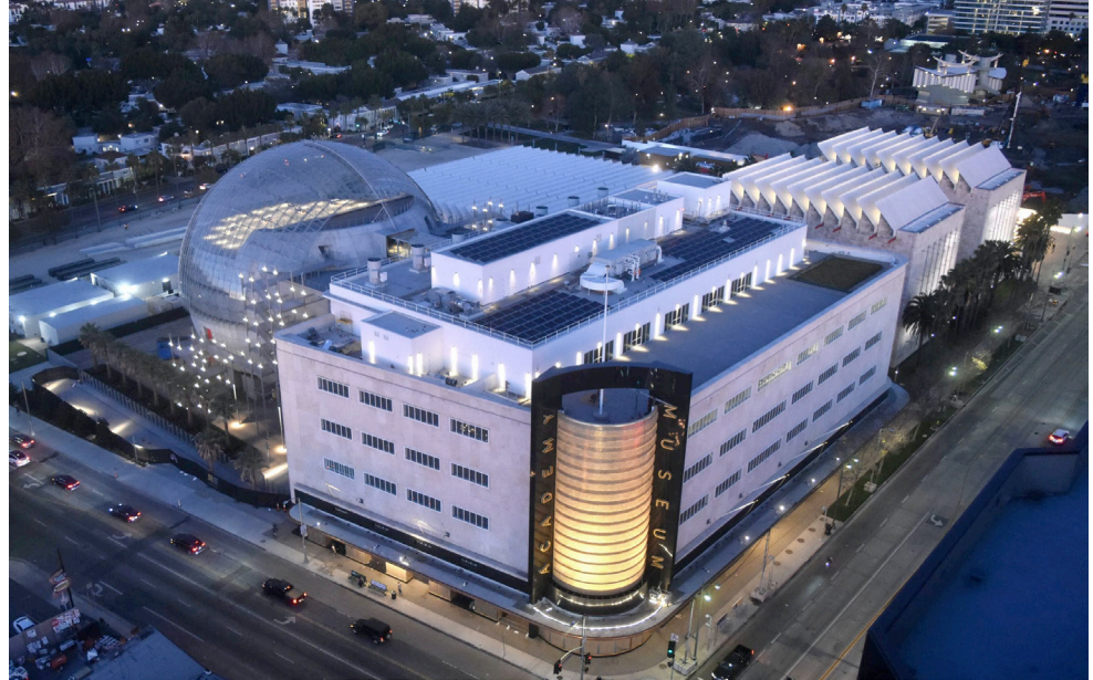
Academy Museum of Motion Pictures – Los Angeles, California

Valley, designed by MVRDV and developed by EDGE, is an 807,300 square foot mixed-use development in Amsterdam's Zuidas business district. The valley in Valley is formed by the void between the building's three towers, or peaks. Valley is made up of 196 apartments, seven stories of offices, a three-story underground parking garage, retail and restaurant spaces, and a cultural center.